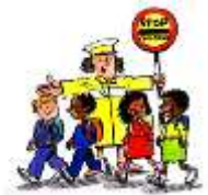
School Traffic Safety